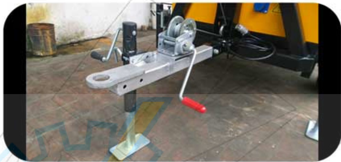
Jack Tools / Dongkrak