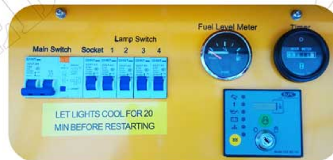
Control Panel with Hour Meter and MCCB for Genset & Lighting Tower