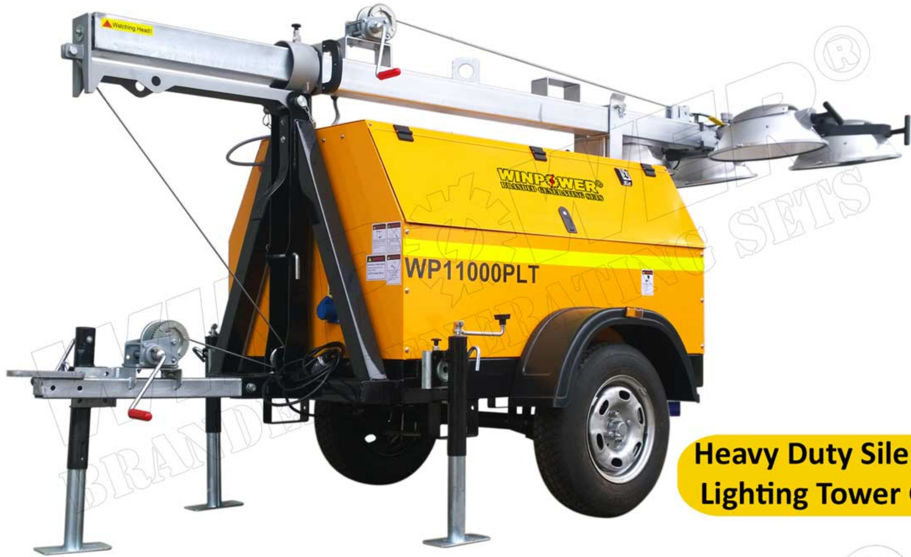
Heavy Duty Silent Type Lighting Tower Genset