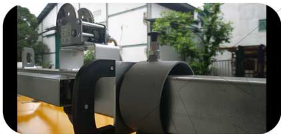
Tower Hold Protector