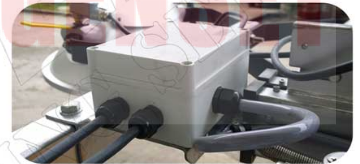
Splitter for Metal Halide Spotlights