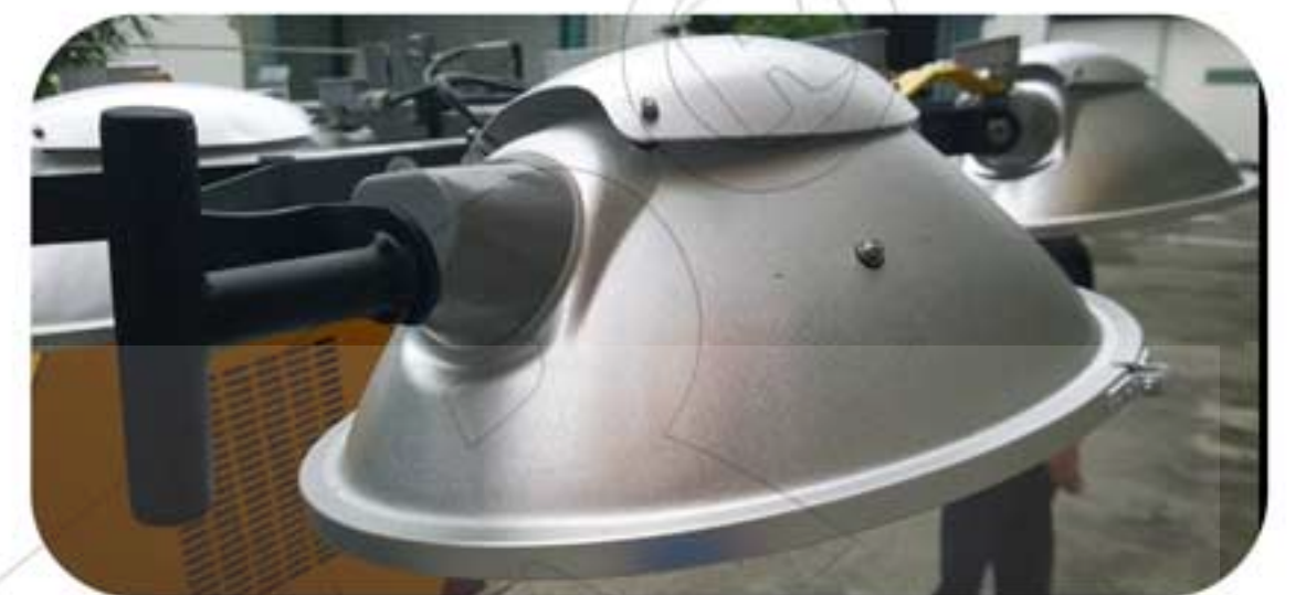
Adjustable Angle for Spot Light