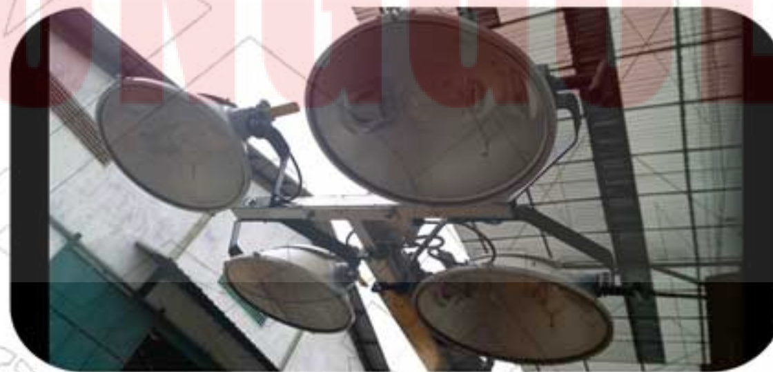
4 Metal Halide Spotlights (4 X 1000 Watt)