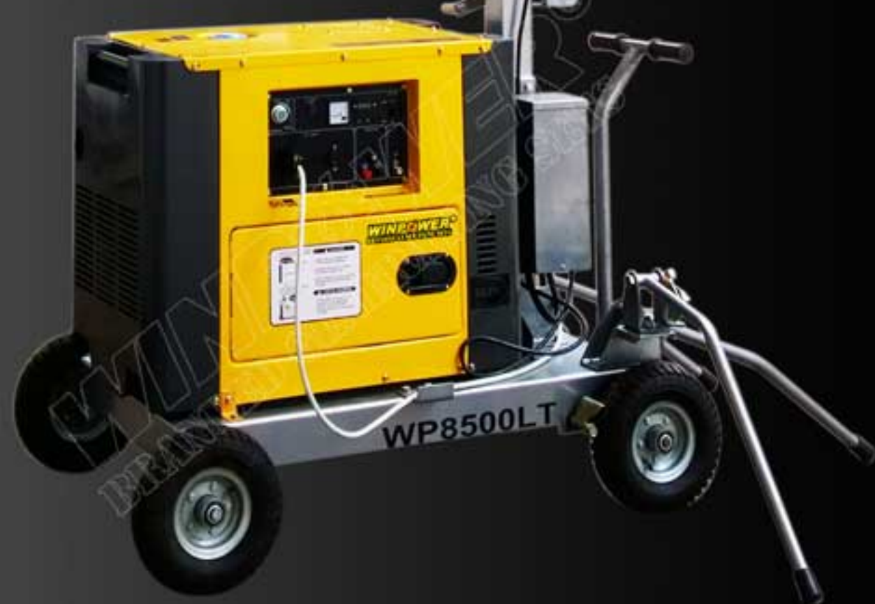
WP 8500 LT 4 x 400 Watt Spot Lights