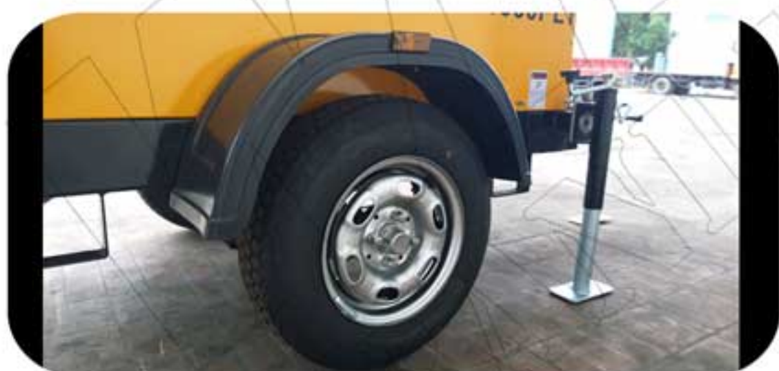
Tires & Fenders