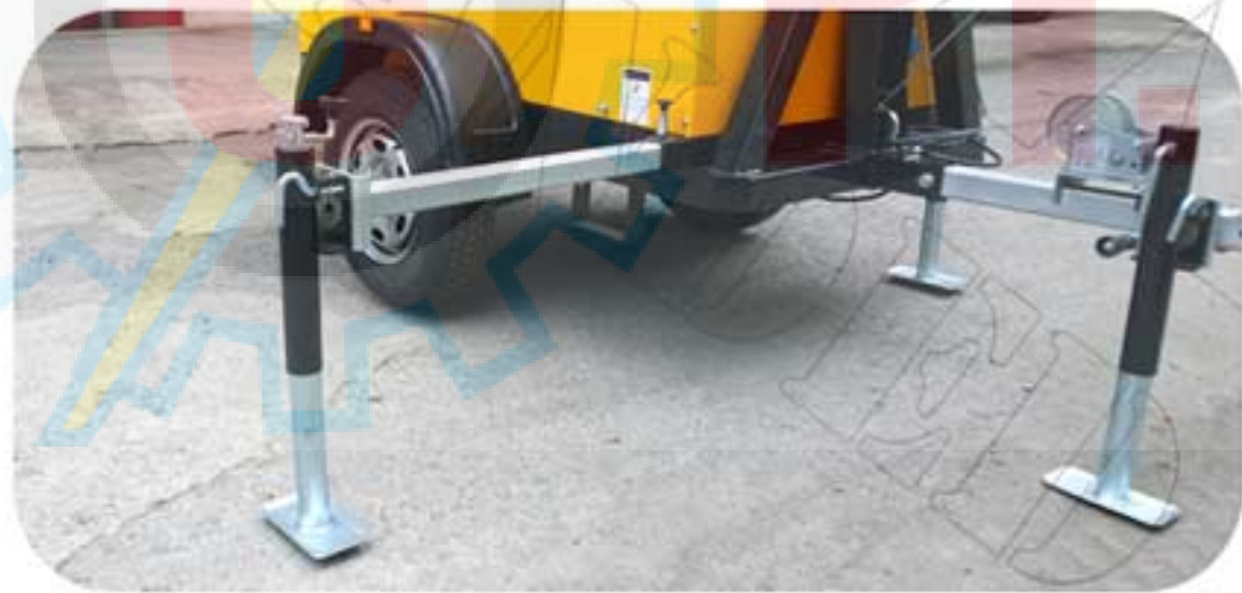
Adjustable Spider Legs